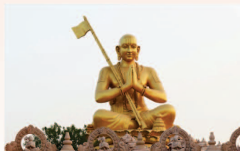
The Statue of Equality