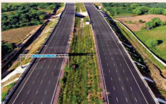
6-Lane Bangalore Highway (NH-44)