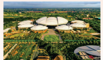
Kanha Shanti Vanam