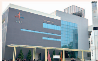
National Remote Sensing Center (NRSC)